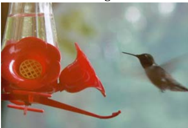
Mr. Ruby-throated hummingbird