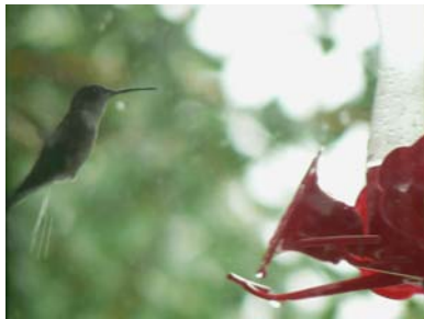
Mrs. Ruby-throated hummingbird